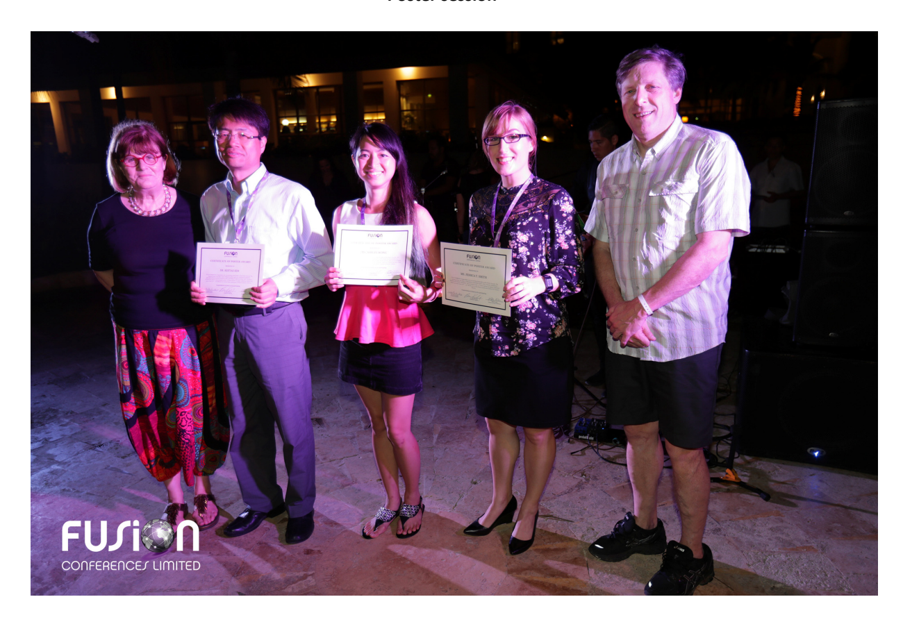
Poster competition winners