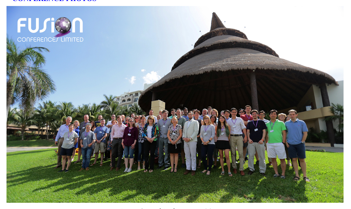
Group photo of Conference participants