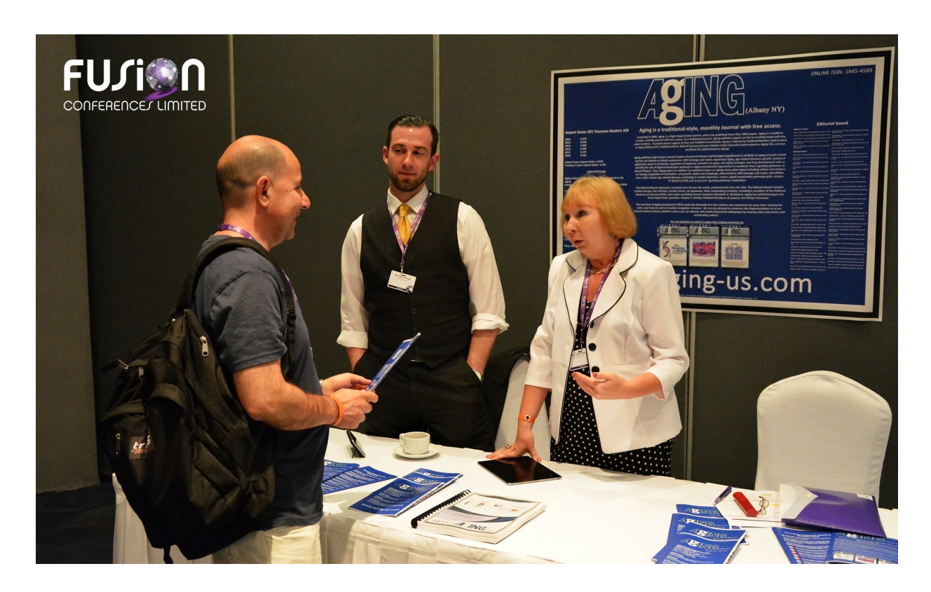
Aging Conference sponsors